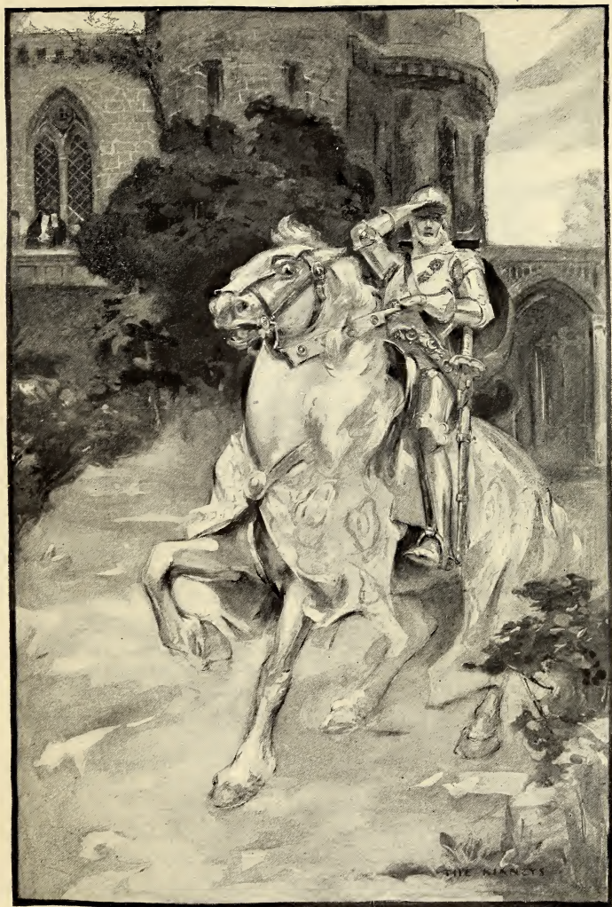
HORSE AND MAN CHAFING WITH IMPATIENCE